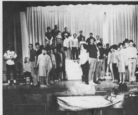
Choir members rehearse numbers in the auditorium Monday night before the presentation of "Dial May for Music," the annual spring show to be given tonight and tomorrow night.

Seniors will be teachers Wednesday during Senior Administration